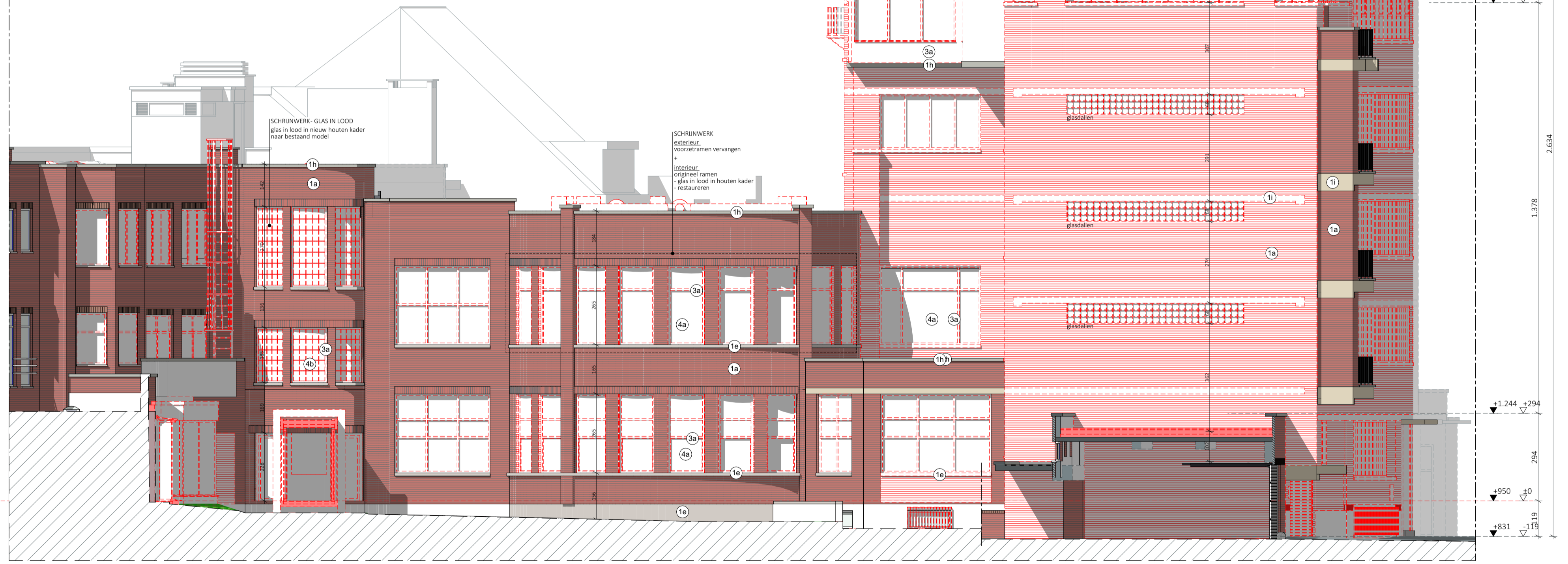
- Gevel 5- 1:100