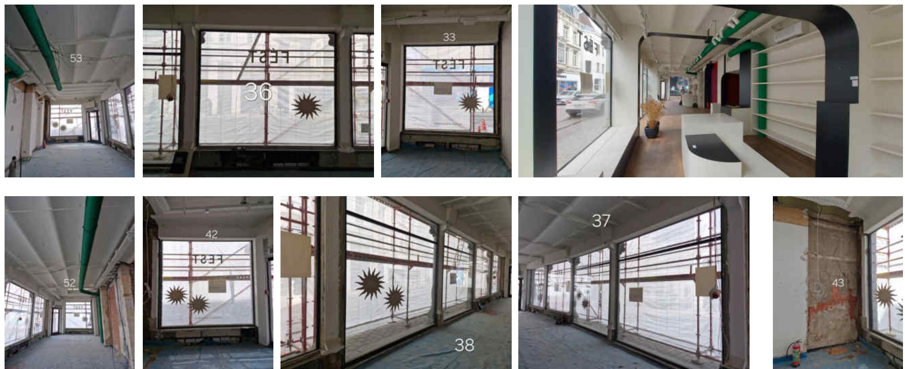
EXISTING STORE GROUND FLOOR WINDOW AREA

NOTE: CURRENT LIGHT SYSTEM FOR BOH ON 1ST FLOOR TO BE RE-USED